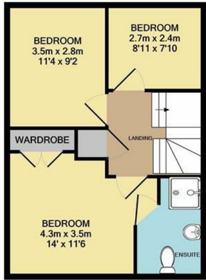
2ND FLOOR APPROX. FLOOR AREA 42.1 SQ.M. (453 SQ.FT.)

TOTAL APPROX. FLOOR AREA 126.4 SQ.M. (1360 SQ.FT.) Whilst every attempt has been made to ensure the accuracy of the floor plan contained here, measurements of doors, windows, rooms and any other items are approximate and no responsibility is taken for any error, omission, or mis-statement. This plan is for illustrative purposes only and should be used as such by any prospective purchaser. The services, systems and appliances shown have not been tested and no guarantee as to their operability or efficiency can be given Made with Metropix ©2021